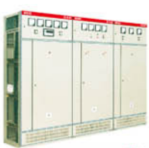
GGD 型开关柜 Switchgear