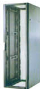
基本配置系列 (Typical configuration series)