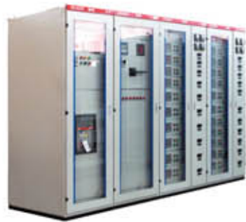
IDCS2000 型开关柜 Switchgear