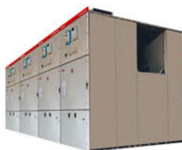
KYN61-40.5 型开关柜 Switchgear