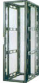
配套B系列： 不包含侧板 Not including side boards