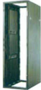
配套C系列： 不包含门 Not including doors