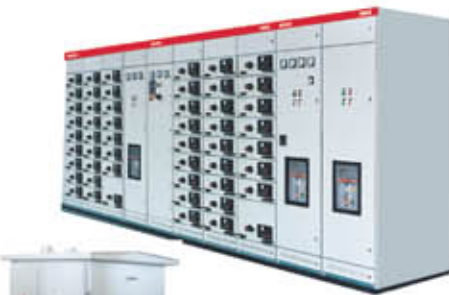
MNS 型开关柜 Switchgear