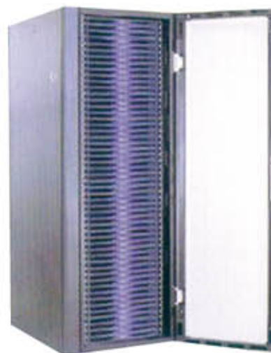
柜宽(Cubicle width)600 mm

In order to raise quality of cable connection at both front and rear of the cubicle, a decorating cover for wiring is set for those cubicles with cubicle width 700mm and 800mm.