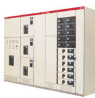
GCS 型开关柜 Switchgear